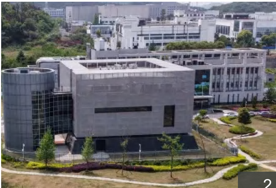
French scientists were reportedly 'kicked out' of the Wuhan Institute of Virology in 2017