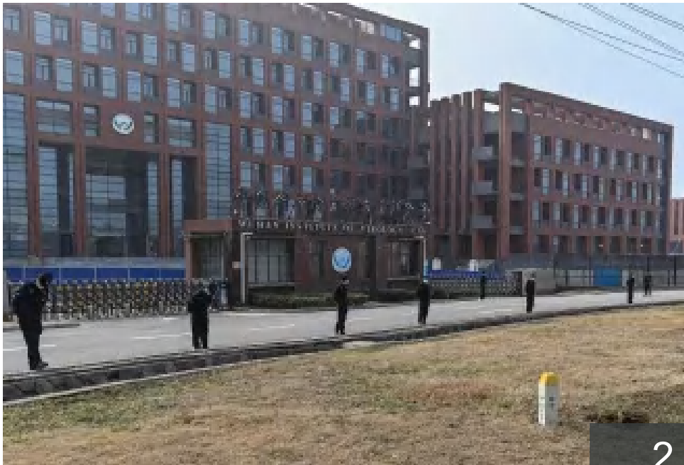
The Wuhan Institute of Virology has come under increased scrutiny over the origins of Covid