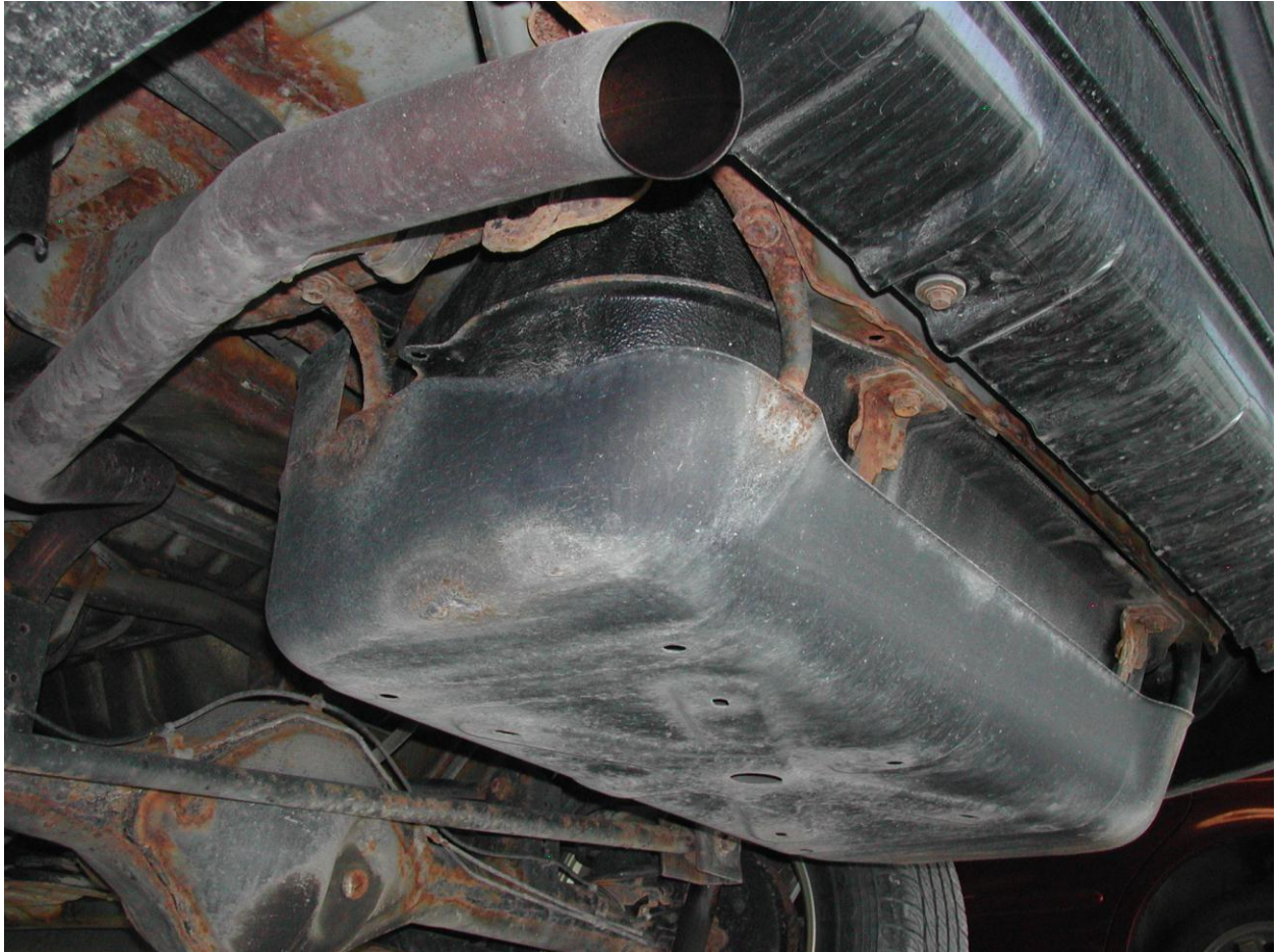
Exhibit A – Encapsulated Suzuki SL-7 Fuel Tank