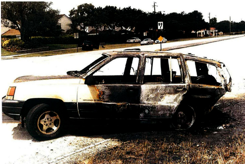
Figure 1 Post-Crash photograph of Grand Cherokee (ZJ) fatal rear impact vehicle.

An example of a Grand Cherokee involved in a rear impact fatal fire crash is pictured below.