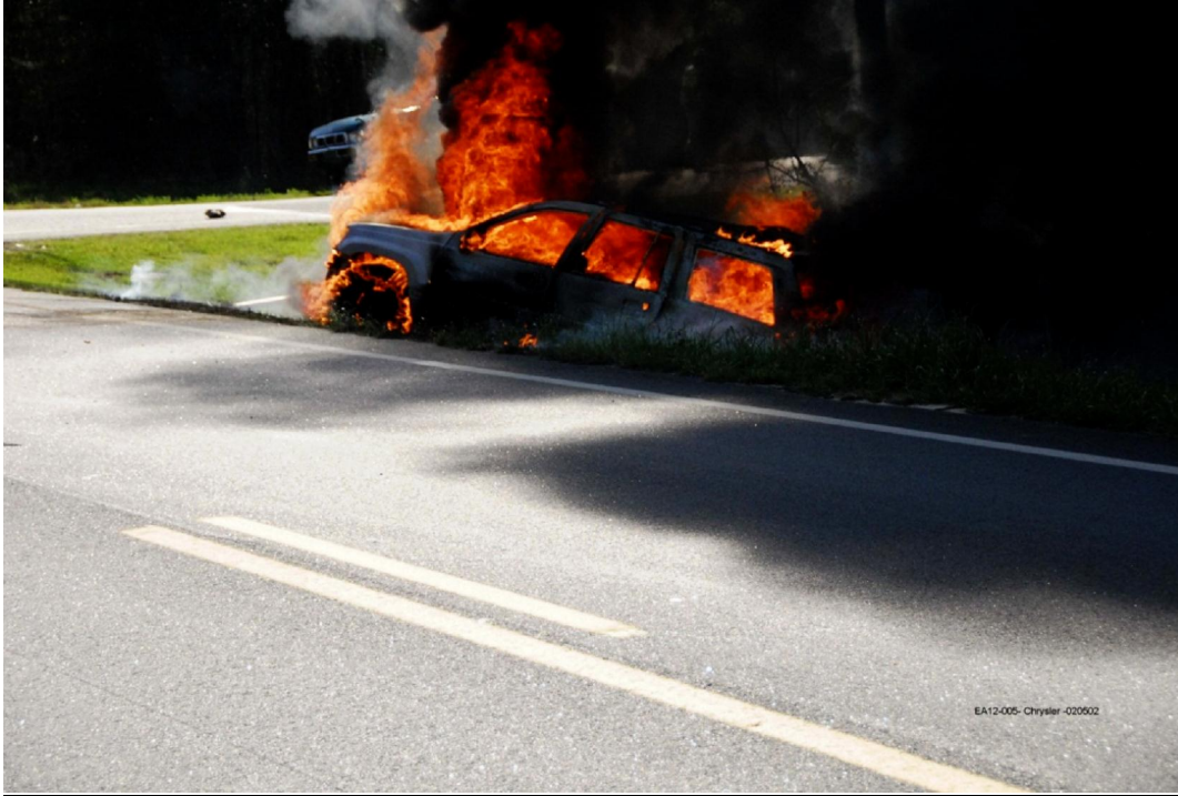
Figure 2- 1999 Grand Cherokee (WJ) Fatal Fire.

The photograph provided below shows a Grand Cherokee in flames after being struck in the rear by a Dodge Dakota pickup truck. A child seated in a rear seat died in this crash.