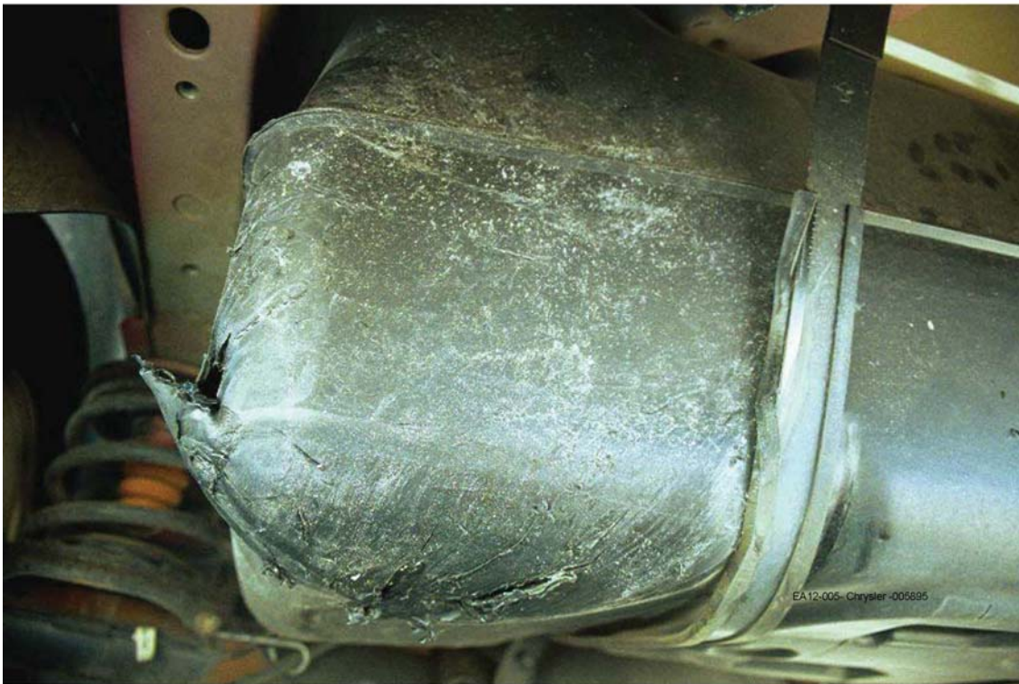
Figure 4 Rear Impact Damaged 2002 Liberty Fuel Tank.

The photograph below depicts a Jeep Liberty fuel tank that ruptured and leaked after the Liberty was struck from behind by a van in stop-and-go traffic.