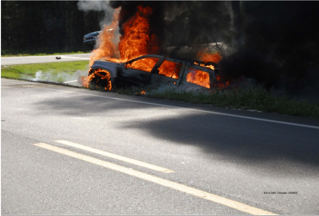
Figure 2- 1999 Grand Cherokee (WJ) Fatal Fire.

The photograph provided below shows a Grand Cherokee in flames after being struck in the rear by a Dodge Dakota pickup truck. A child seated in a rear seat died in this crash.