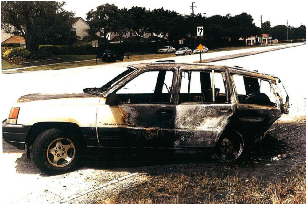
Figure 1 Post-Crash photograph of Grand Cherokee (ZJ) fatal rear impact vehicle.

An example of a Grand Cherokee involved in a rear impact fatal fire crash is pictured below.