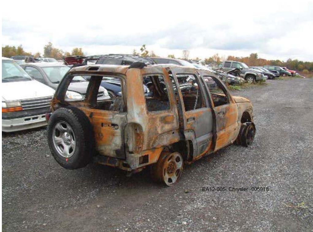
Figure 3 - Post-Crash photograph of 2004 Jeep Liberty Struck from behind by a Plymouth Neon.

A Jeep Liberty that burst into flame after being struck in the rear by a Plymouth Neon is pictured below. The occupants were able to exit the vehicle without being burned.