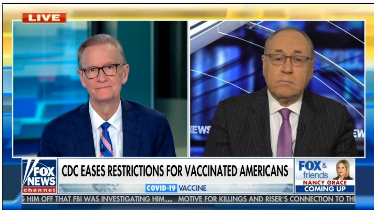
Siegel Demands Vaccination Thru Coercion

As implied by the intro above, I have no interest in mincing words about the safety and well-being of our K-12 children. This now applies to the young adults who are about to be victimized by the Ivy League presidents, and the entire "higher education" industry. But to assess the essence of what these lofty "leaders" have planned, we review the stature of Dr. Marc Siegel: